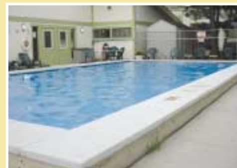
Our outdoor pool provides a great way to exercise and refresh.