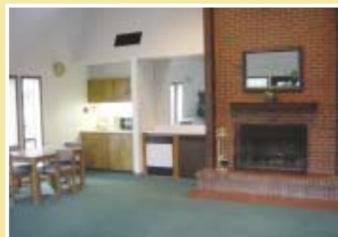
Our spacious clubhouse is a great place to gather around the hearth.