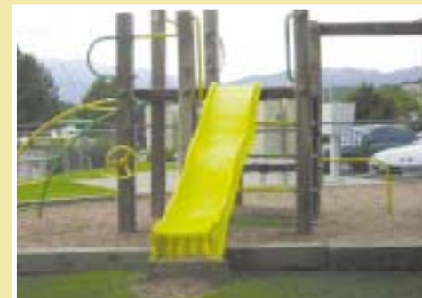
Our playground offers a wide open space for fun.